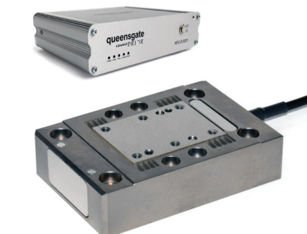
Queensgate's nanopositioning stage combines small size with a millisecond response time, while a new digital controller (top) offers precision, accuracy and speed (Courtesy: Queensgate/Prior Scientific).